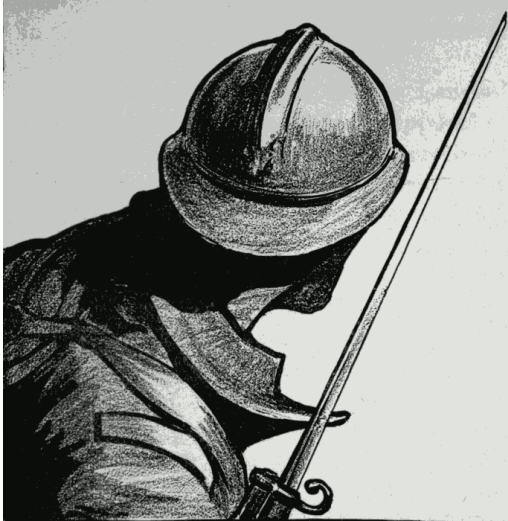
A French Soldier.

We have moved to the famous Langhof Chateau on the Lille road. This is supposed to have belonged to Hennessey of “Three Star” fame, but the Germans had been through the wine cellars. We looked very, very carefully, but only found empties. My batman has made me comfortable. I’m writing this on a washstand; in front of me I have a bunch of roses in a broken vase. My trench coat is hanging on a nail from a coat-hanger. A large piece of broken wardrobe mirror has been nailed up to a beam for my use. One of the men just came in to ask if a trousers press would be of any use. We have a fine little bureau cupboard of carved oak; we use this for the rations. A pump, repaired with the leather from a German helmet, has been persuaded to work and has been busy ever since. The roof of my cellar is arched brick and has a few tons of fallen debris on the floor upstairs. That strengthens it. It is shored up from inside with rafters. This